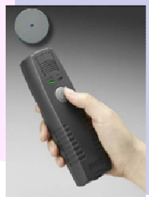
How does Mini GuardScan work?

This is normally given to the security guards and is useful to check the patrolling and clock-in of the designated patrolling points. The information can be downloaded to the PC and data send via email.